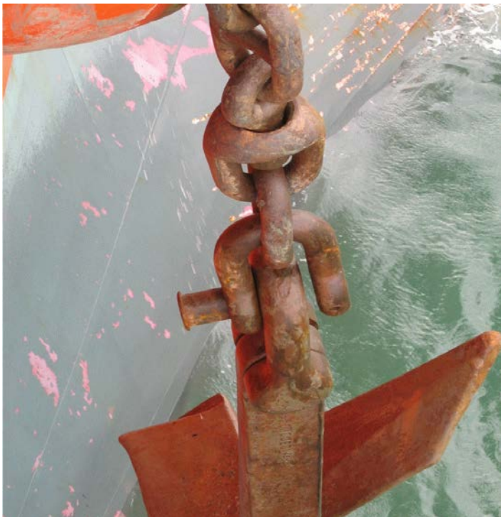
D-shackle bolt coming loose due to detached securing pin

DNV GL, Gard and The Swedish Club have observed a negative trend in loss of anchors and chains and associated costs. A study into the root causes has revealed that a majority of these losses could be avoided by increased awareness of the environmental limitations, more attention to some key technical issues and general good seamanship. This article is a brief summary of the technical issues related to anchor losses.